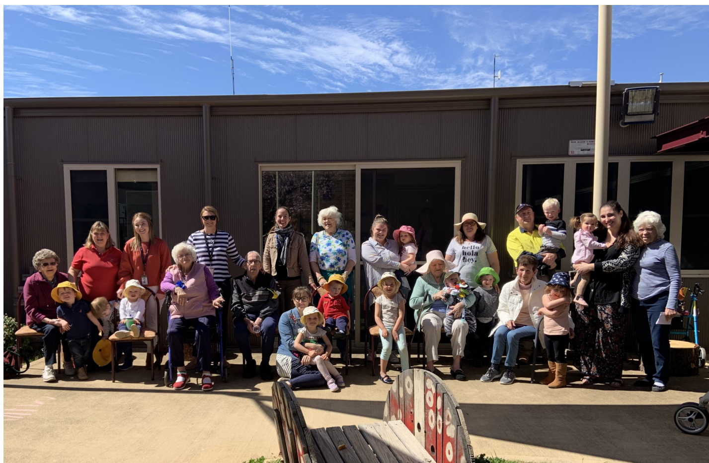
Prunus Lodge Aged Care Residents visiting Molong Playgroup Thursday, 12th September 2019