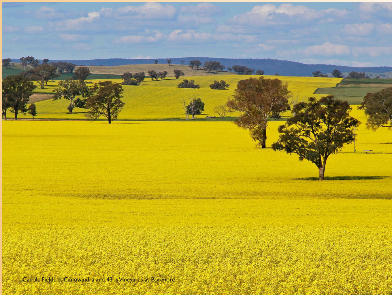
Canola Fields at Canowindra and 43 is Vineyards at Borenore.