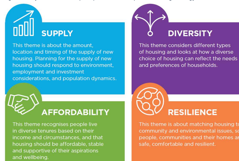
Figure 1: Key themes - NSW (2020) Discussion Paper: A Housing Strategy for NSW.