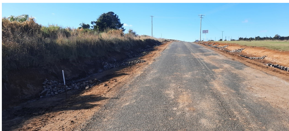
Drainage work has been undertaken to prolong asset life