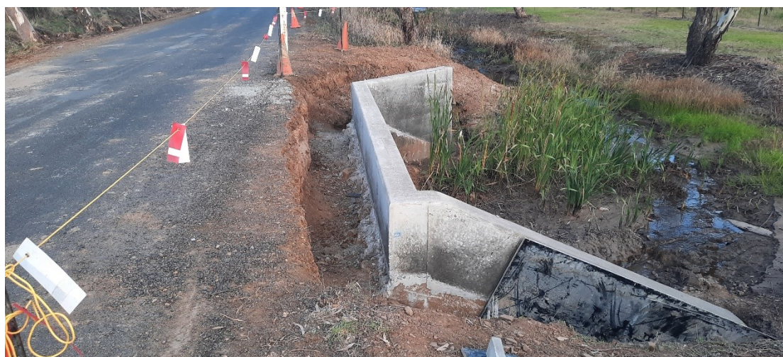
Culvert Extension to allow for road widening

Council staff are corresponding with Essential Energy regarding relocation of electricity pole infrastructure.