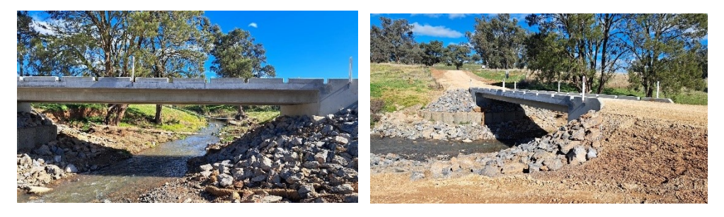
Completed work at Canomodine Lane Bridge