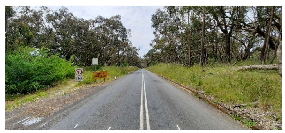
Cargo Road - December 2022