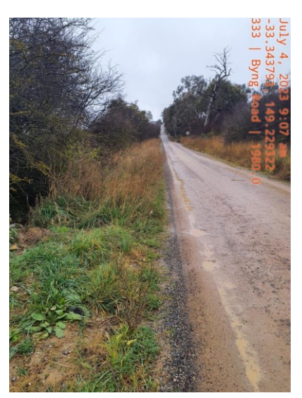
Byng Road - Before