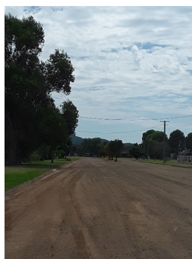
Wilbe Street, Eugowra