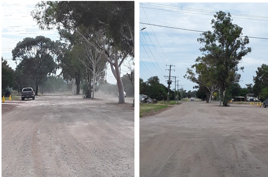
Aurora Street, Eugowra