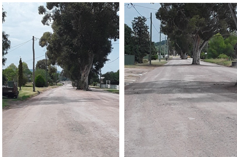
Evelyn Street, Eugowra