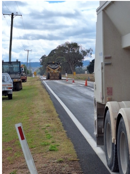
The Escort Way (MR377)