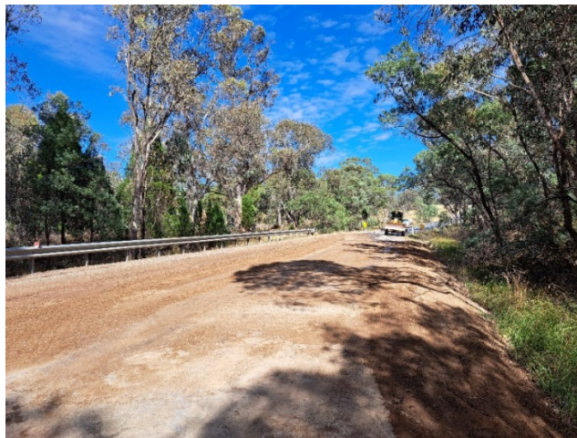
Henry Parkes Way (MR61)