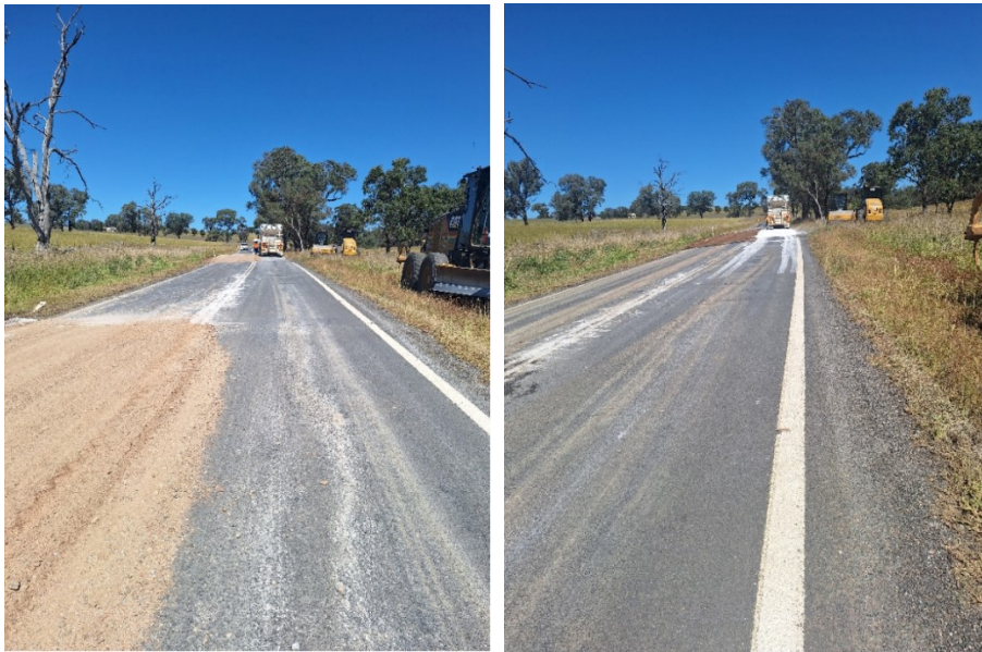
Peabody Road (MR359)