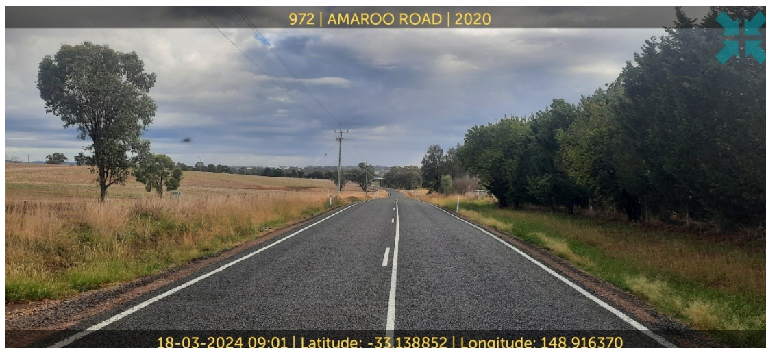
Amaroo Road – Completed