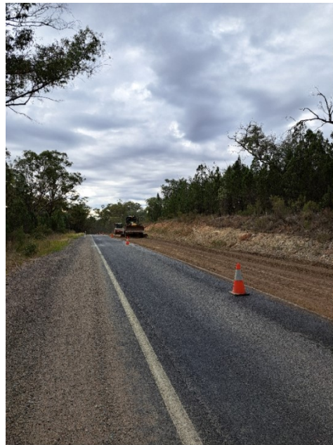
Henry Parkes Way (MR61)