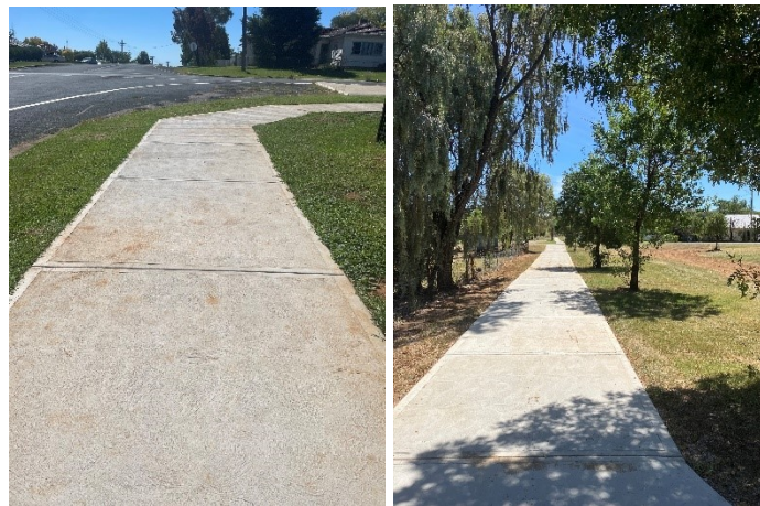
Footpaths in Cudal, Molong and Yeoval