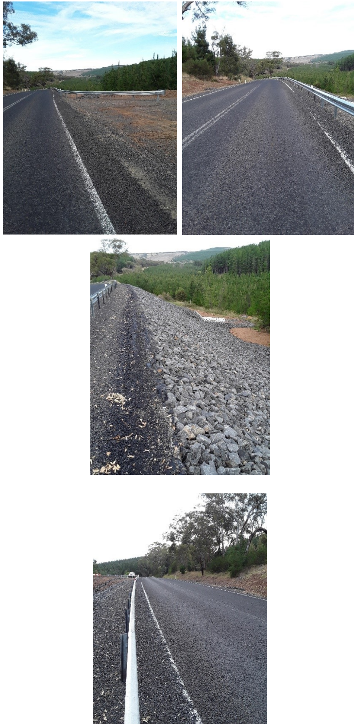
Four Mile Creek Road – Completed Work