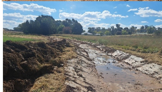
Merga Street drainage