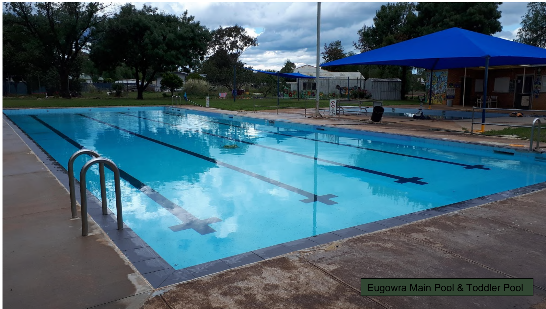
Eugowra Main Pool & Toddler Pool