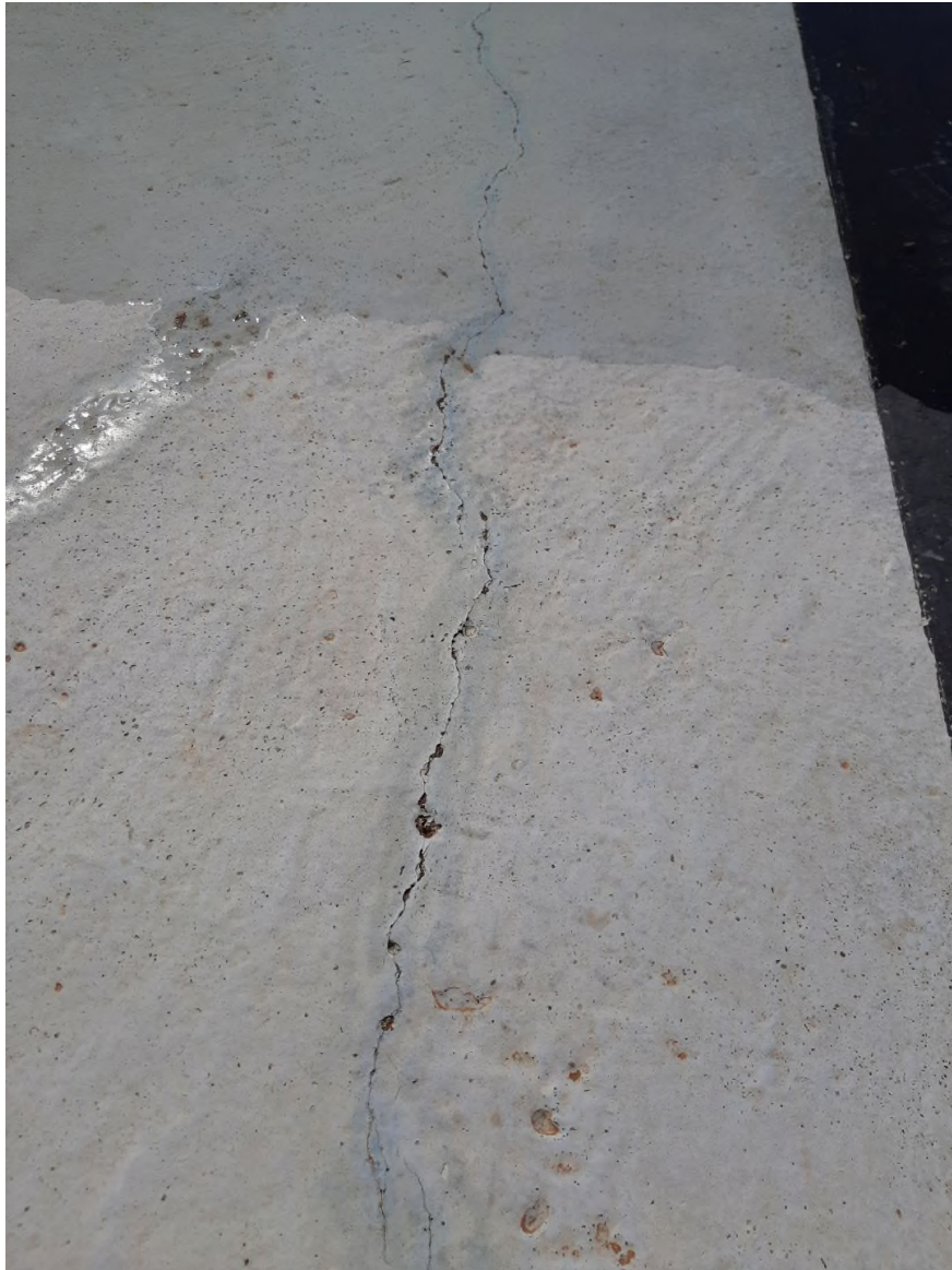
Eugowra Main Pool Shell after 2022 flood