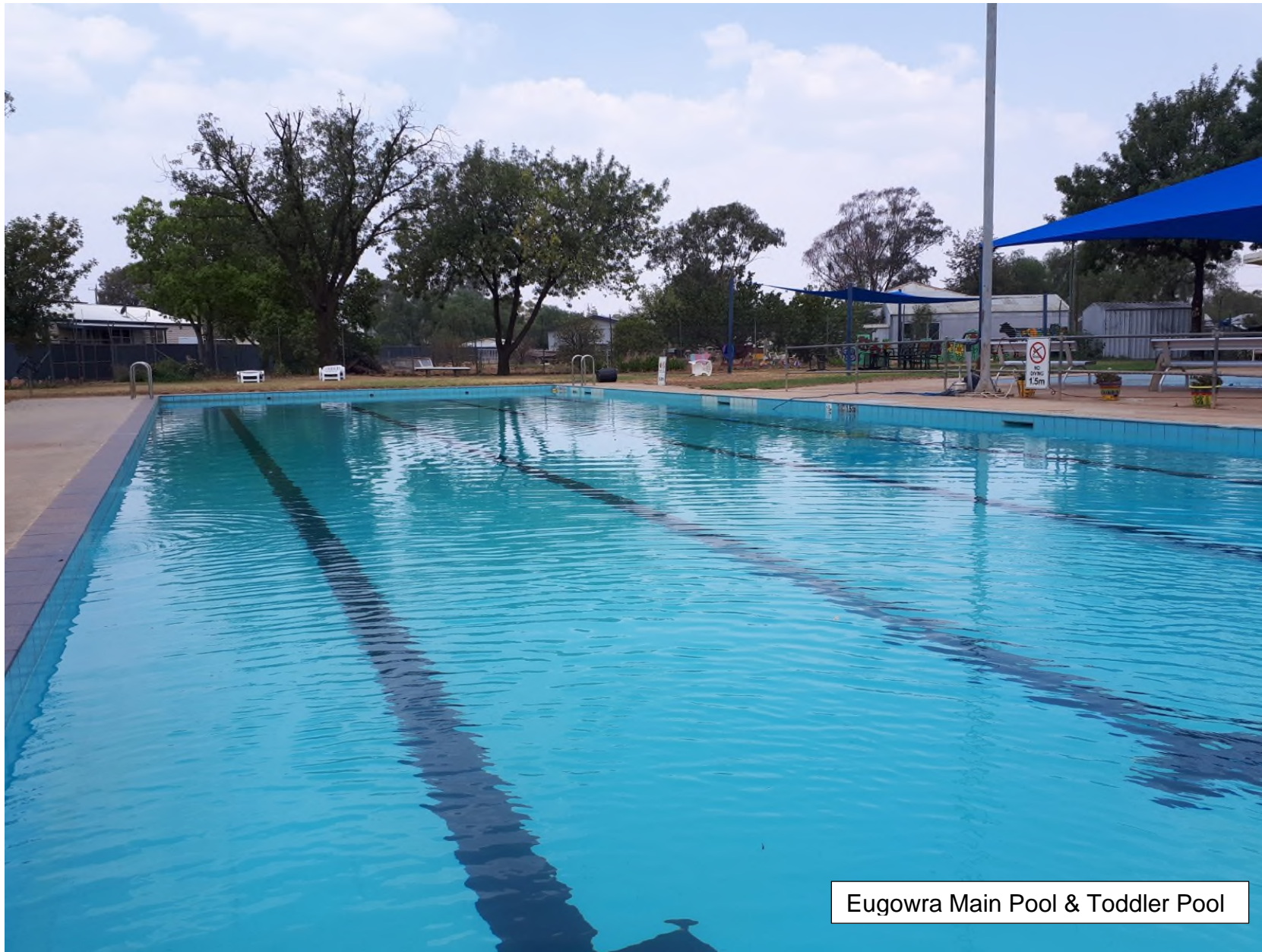
Eugowra Main Pool & Toddler Pool