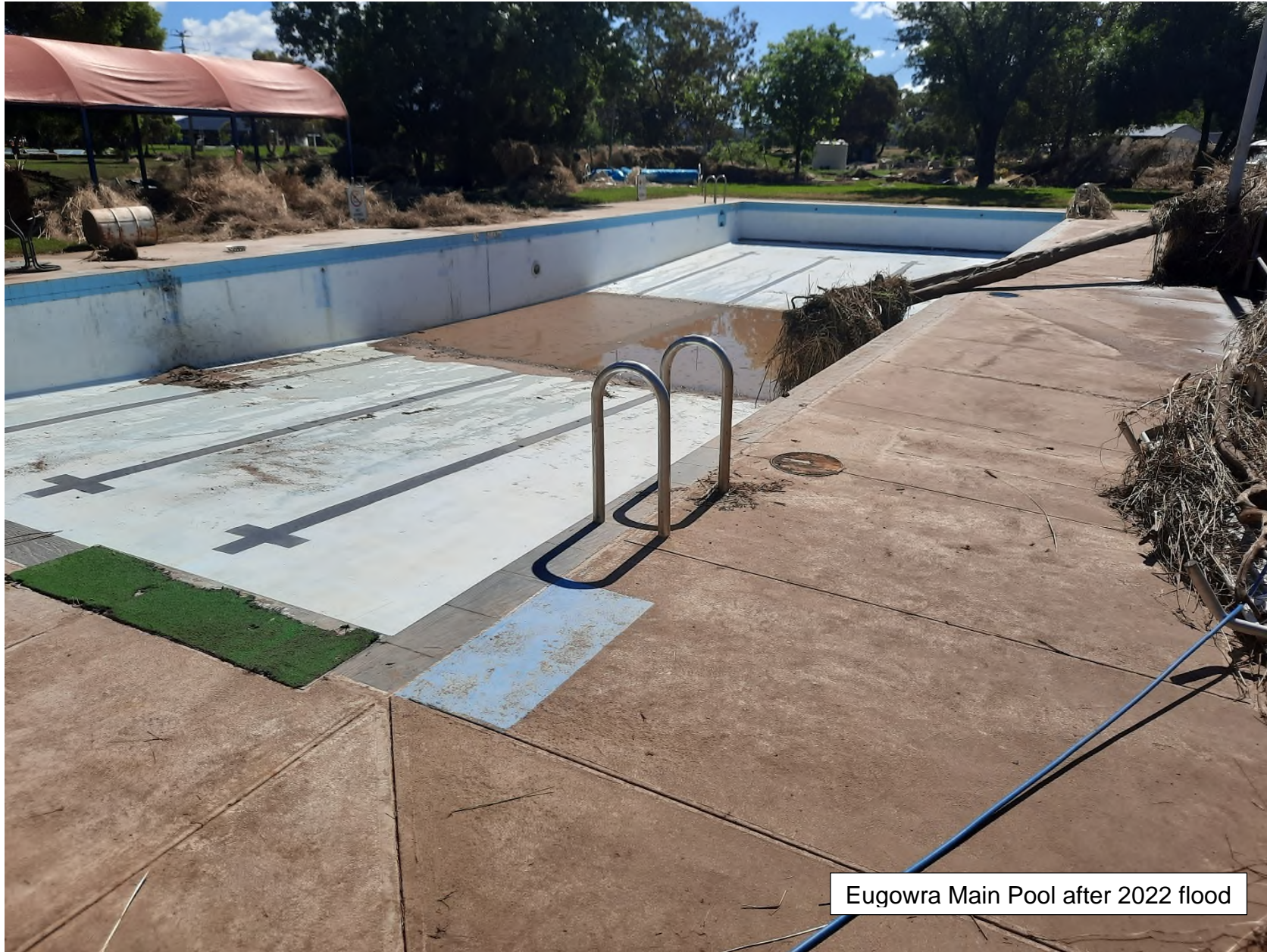
Eugowra Main Pool after 2022 flood