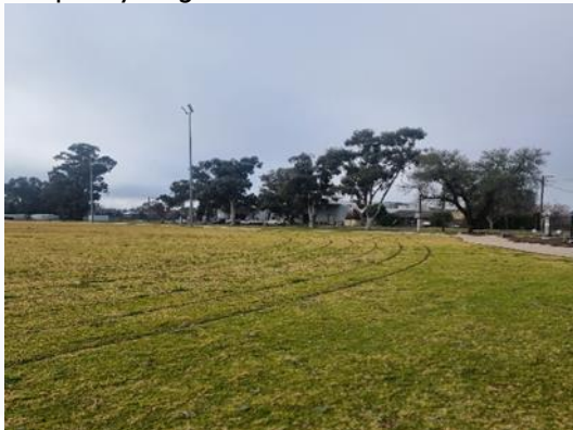
Temporary Stage Area