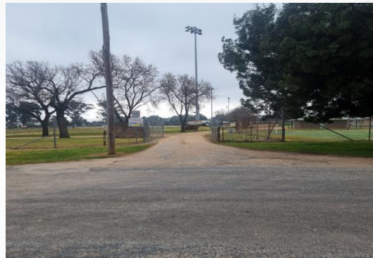
Access via Tilga Street