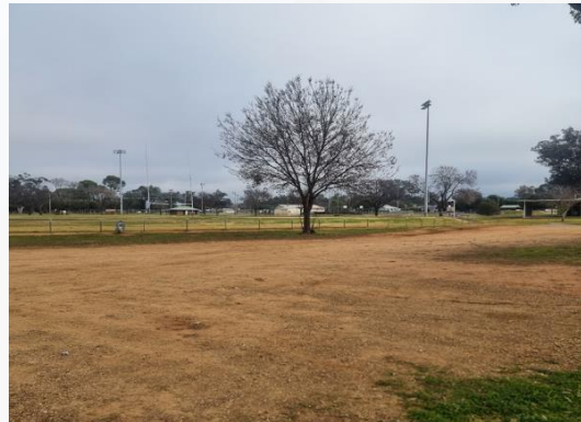
Market Stalls Area