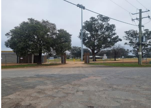
Access via Ross Street